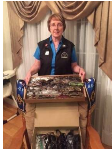
World Sight Day by Anchor Point Lions on World Sight October 12, 2017