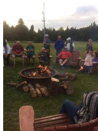
Campfire at Camp A Rama, July 2017