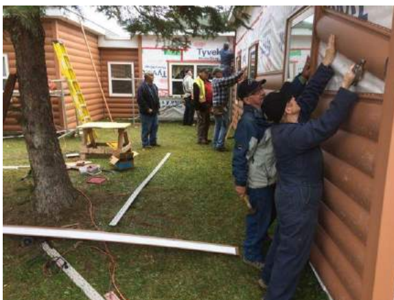
Lions replacing siding on LMSMC--October 2017