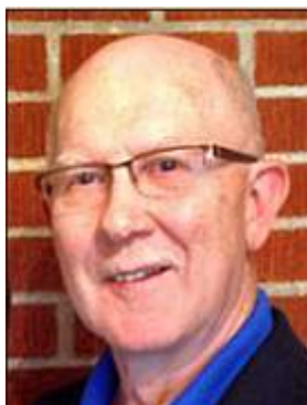
District Governor DG Doug Genge 2017-18