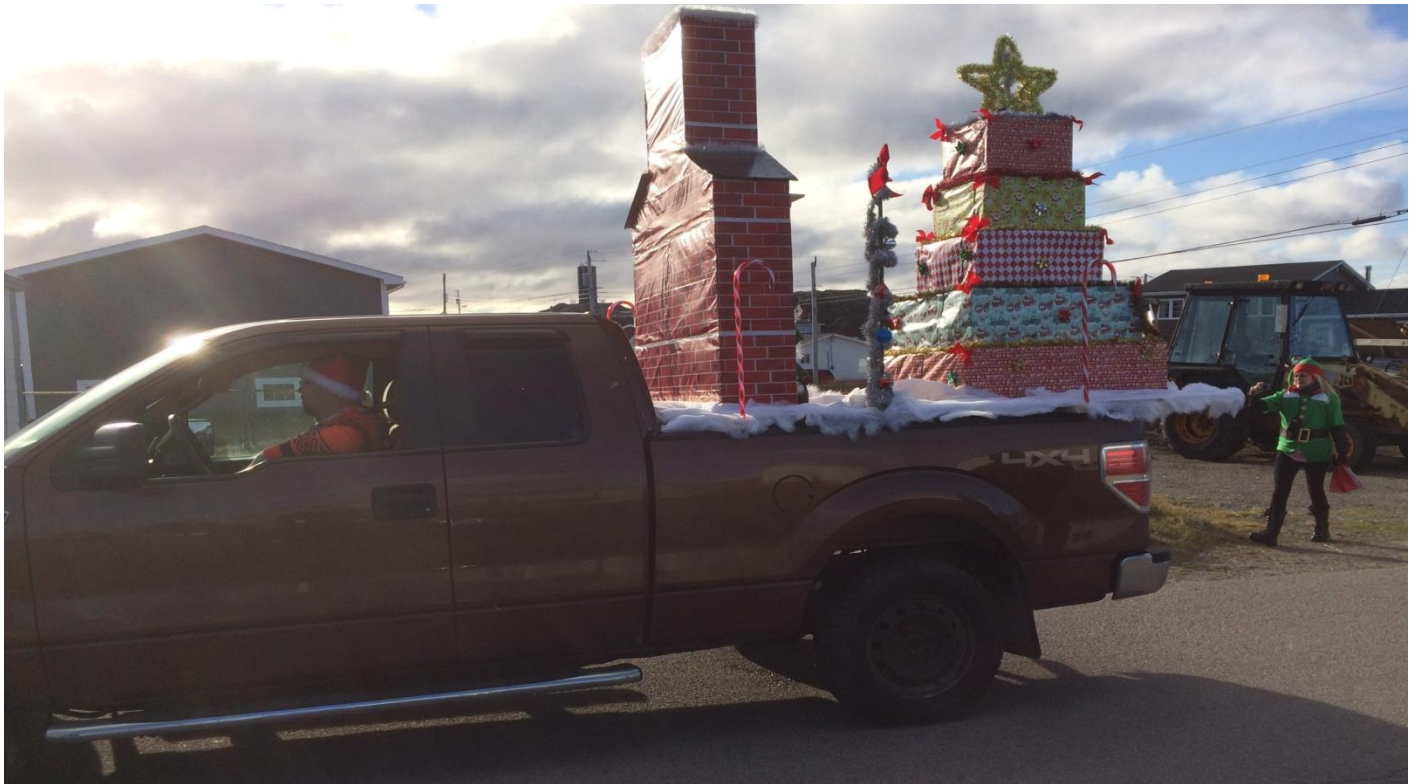
Lions of Ramea NL hold a Christmas Supper for community residents.