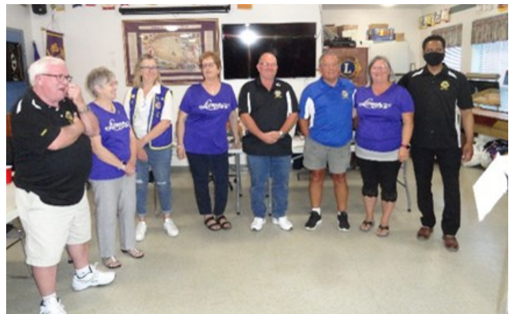
After the installation of officers and directors they enjoyed sandwiches and beverages.