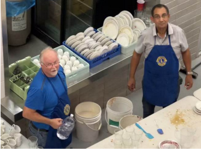
Berwick serving supper for Youth Hockey Group