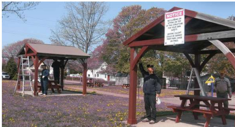
Several members of the Amherst Lions Club gathered at the Lions Park on a sunny day to stain 3 old Gazebos. The Gazebos are in much use by the community but were getting a bit shabby looking. Here the lions are hard at work and the results were a great improvement.