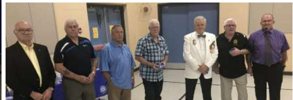
Congratulations Lake Echo