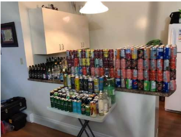
The refundable that Lion Don sorted and delivered to the enviro depot.