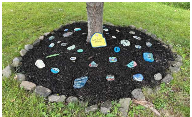
The NS Strong Rock Garden at the local elementary school that some Lions weeded and put mulch on.