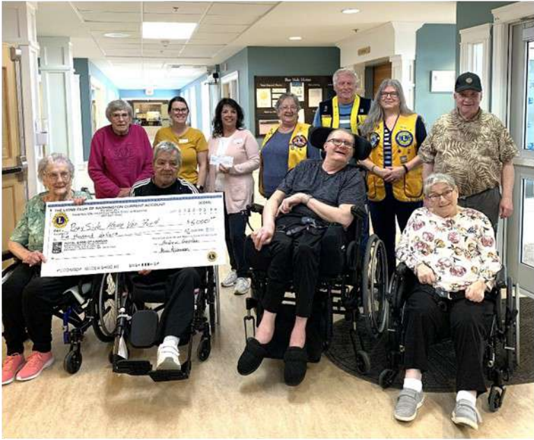
The Barrington Area Lions Club donated $5000 to the Bay Side Home van fund.