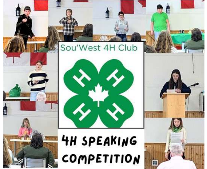
The Barrington Area Lions Club donated the use of their hall and attended their local 4H Club's speaking competitions. 4H members showed their public speaking skills with speeches and demonstrations. (March 15, 2025)