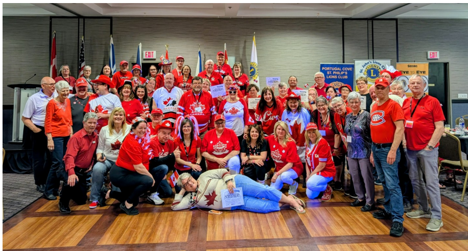
A few of N2's finest dressed up for Your Canadian Eh'