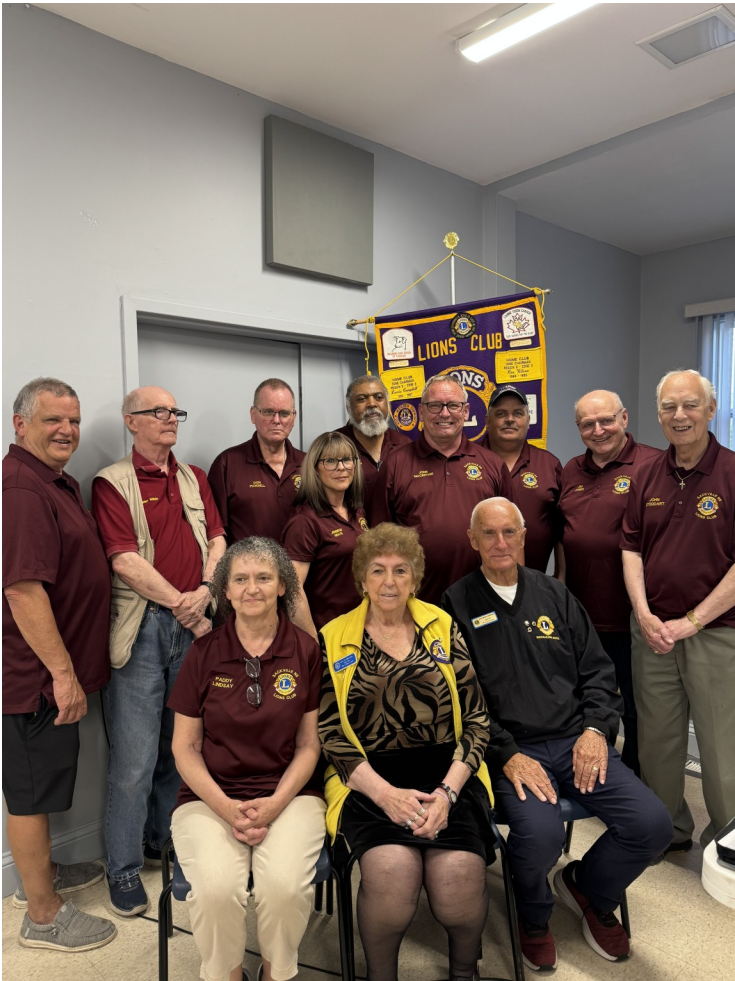
2025 - 2026 Executive